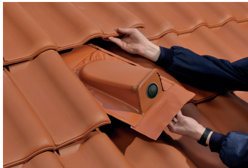
2. Install pipe leadthrough and ensure that it is placed under the roof bricks (all three sides covered over)