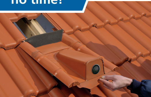
1. Insert pipe fairlead