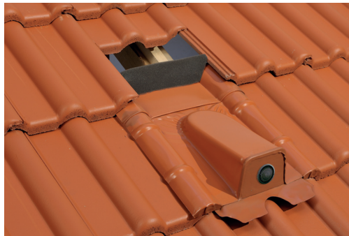
2. Place on tile on left and right