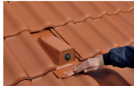
3. Form the lead apron