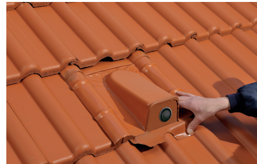
3. Cover concrete roof tile and form lead apron