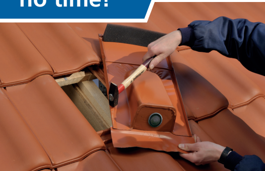
1. Flatten water fold so that the brick bonding makes good contact